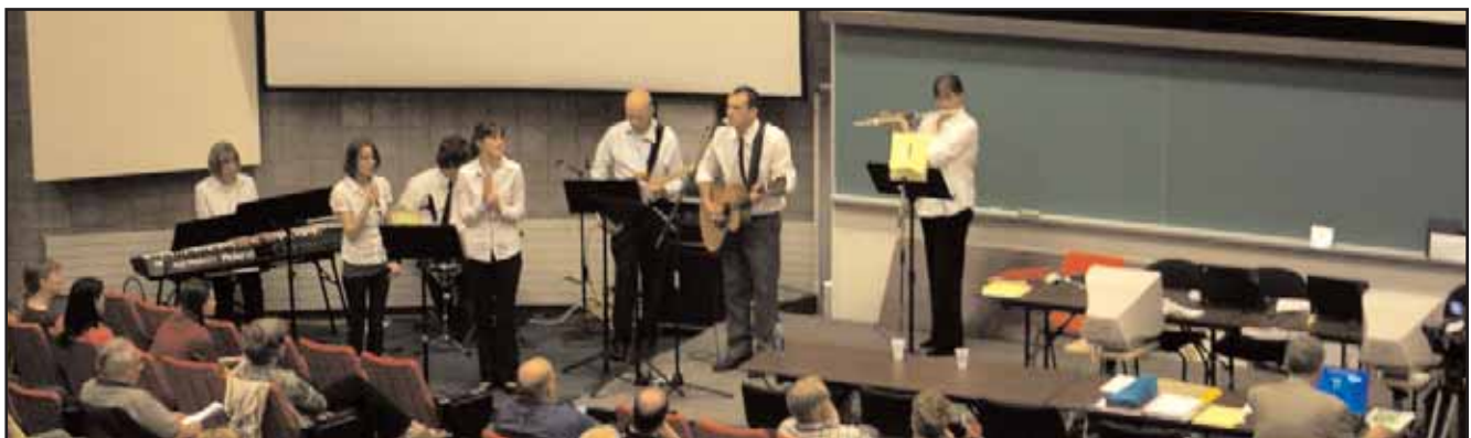
Praise Team from Grace Church, Ottawa