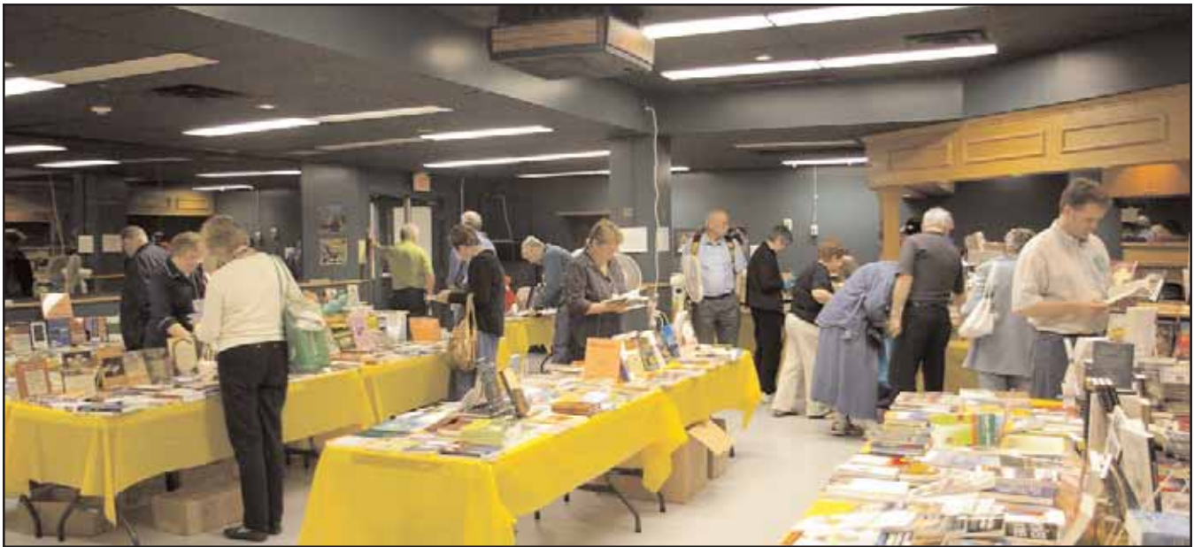
Commissioners browsing The Bookroom during breaks.

the school and commended the Assembly for approving the establishment of the new chair of theology.